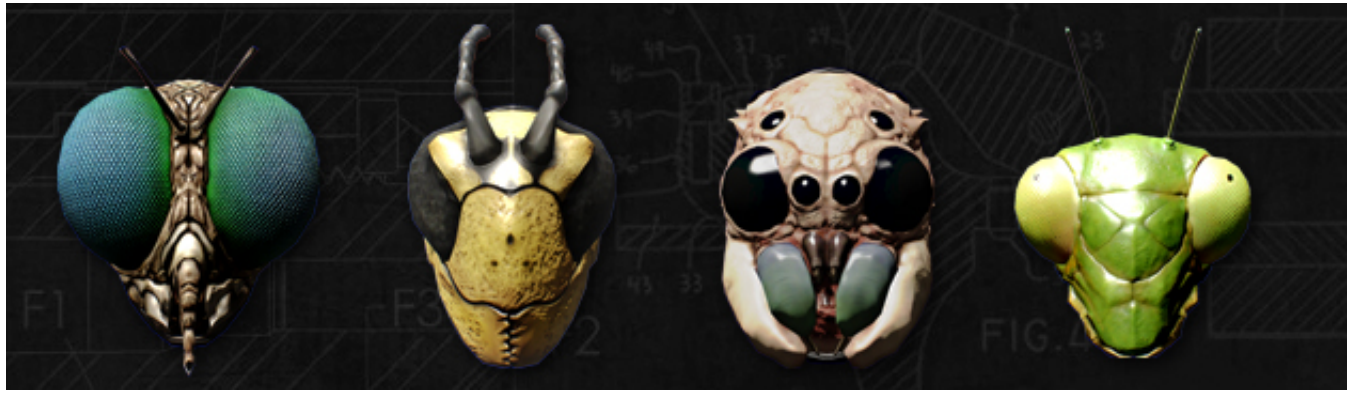
•Four new masks – It's not a proper Gage pack if it doesn't have some sweet masks to go with the guns. This time the focus is on nature's most violent predators, the Vespula, Asilidae, Tarantula and the Sphodromantis. These are collected through the new achievements connected to the Gage Sniper Pack DLC.