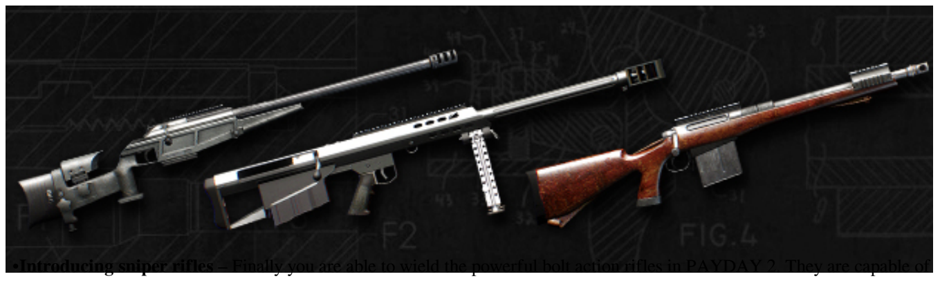
the highest level of accuracy over extreme ranges and are more powerful than anything else you can carry. All three sniper rifles - the Rattlesnake, R93 and the Thanatos .50 cal - have their own unique weapon modifications to customize them with.