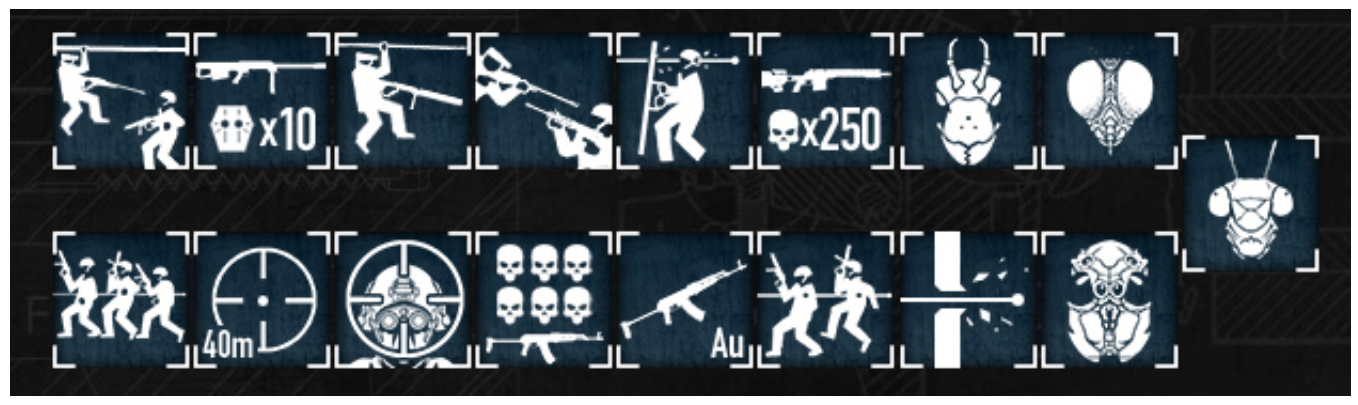
•17 new achievements with in-game rewards – This time around the achievements not only gives you a serious challenge, but completing them also gives you rewards such as masks, materials, patterns and weapon modifications for the sniper rifles.