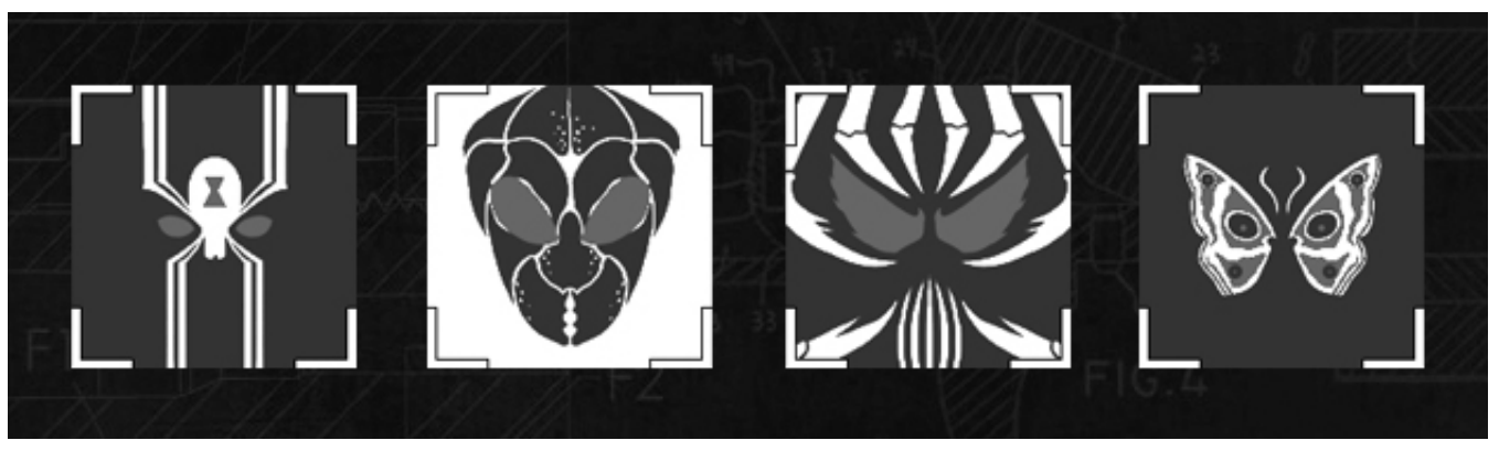
•Four new patterns – What would four new masks and materials be without the patterns to try them with. The new patterns are the Venomous, Spider Eyes, Wings of Death and Bugger patterns. These are collected through the new achievements connected to the Gage Sniper Pack DLC.