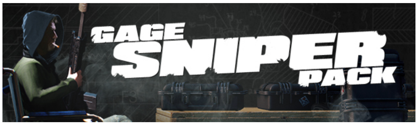
The Gage Sniper Pack DLC is the seventh DLC pack for PAYDAY 2 and adds powerful sniper rifles to the player's weapon arsenal. The bullets from a sniper rifle have armor penetration which means they can go through objects like walls. One bullet can even pierce several enemies.

Three sniper rifles, weapon mods, four new masks, patterns and materials as well as free updates like the golden AK.762 rifle, 17 achievements and the ability to move and re-name weapons and masks in the player inventory.