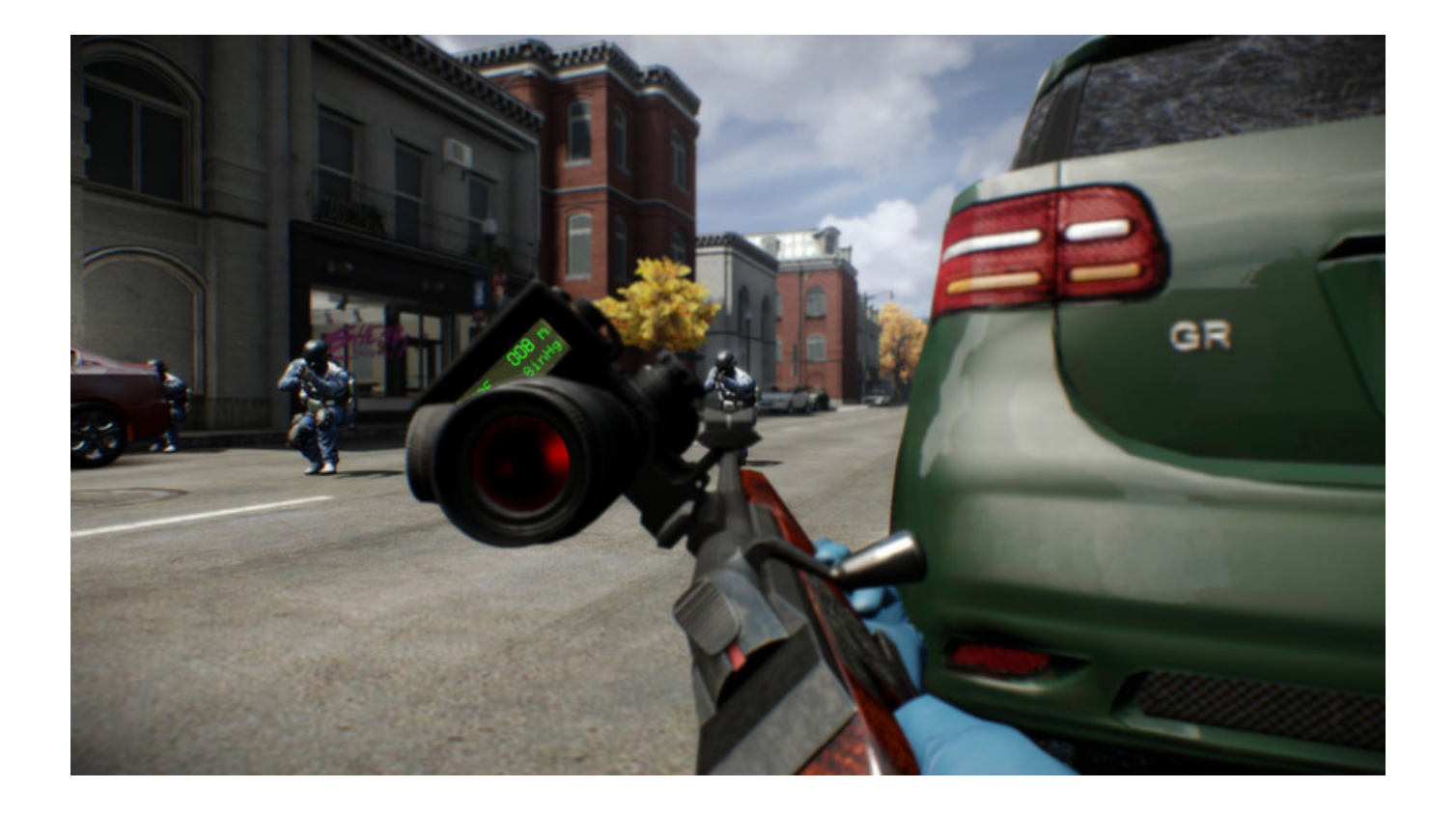
PAYDAY 2: Gage Sniper Pack Full Crack [hack]